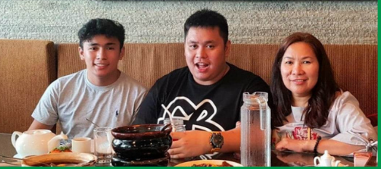
Qoutes to live by: Whenever you receive a blessing from God, be a blessing not just to your family but to those who are in need even if you don't know them personally. Always be thankful and grateful to God at the end of the day.